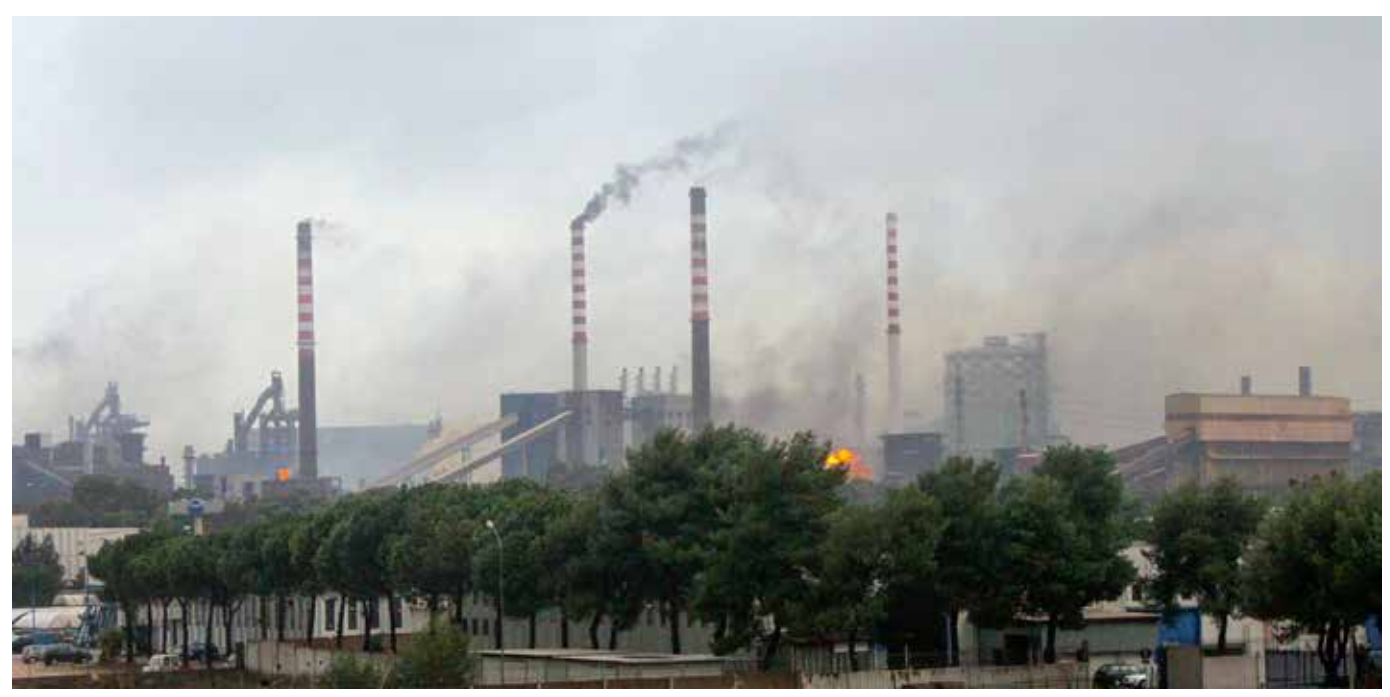
The ILVA steelworks: end of a long-running legal dispute.

reach the agreement, during which complex proceedings were also conducted under the legal assistance umbrella. Ultimately, the assets that had been frozen in Switzerland were returned via channels other than legal assistance.