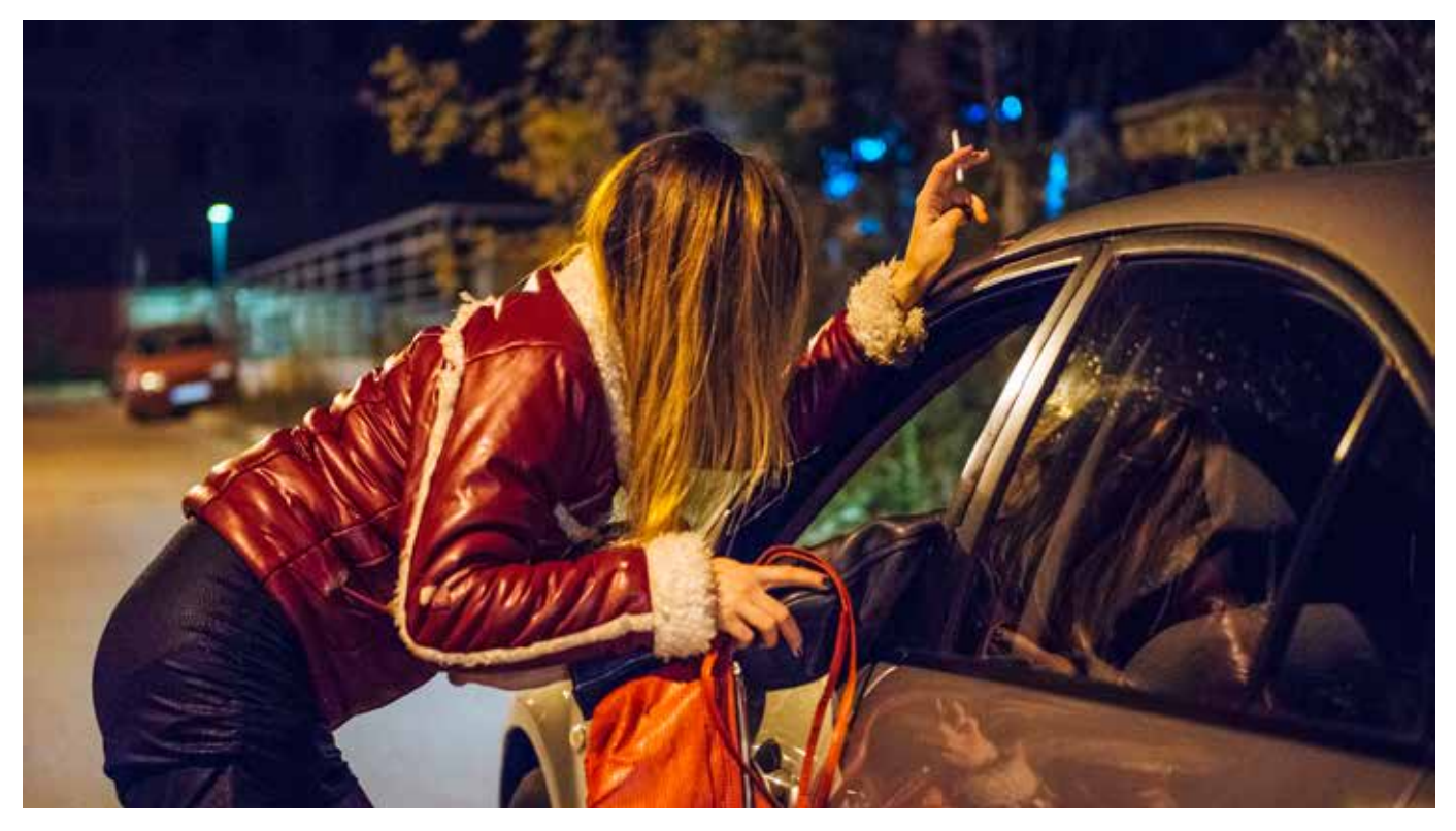
The fight against human trafficking is an international one.

The JIT offered an opportunity to share knowledge and thus conduct investigations in both countries as efficiently as possible. This approach makes it possible for the less privileged countries within the EU, in particular, to conduct complex and costly criminal proceedings that might otherwise be impossible for them. This is because Eurojust assumes the costs of the JIT. With this financial support, Eurojust makes a decisive contribution to fighting crime in its partner states.