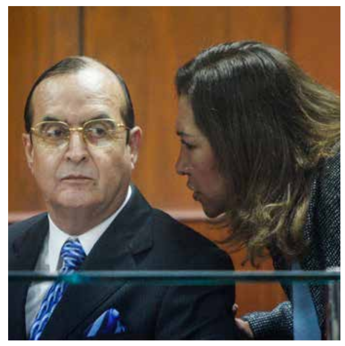
The former head of Peru's secret service in court with his lawyer.

The Zurich public prosecutor's office has received around 35 requests for legal assistance in connection with this web of cases since November 2000. Some of these could not be considered for reasons such as an insufficient description of the facts. The other requests were executed up to 2006, and the evidence that was collected – primarily banking documents – was sent to Peru. Switzerland has also already handed over 93 million dollars to Peru, with a further approximately 23 million dollars remaining frozen in Swiss accounts in connection with the investigations. However, since the persons concerned have to date evaded criminal prosecution, and Peruvian law does not permit suspects to be tried in absentia, it has not yet been possible to conclude a number of the criminal proceedings, and present Switzerland with any legally enforceable forfeiture order.