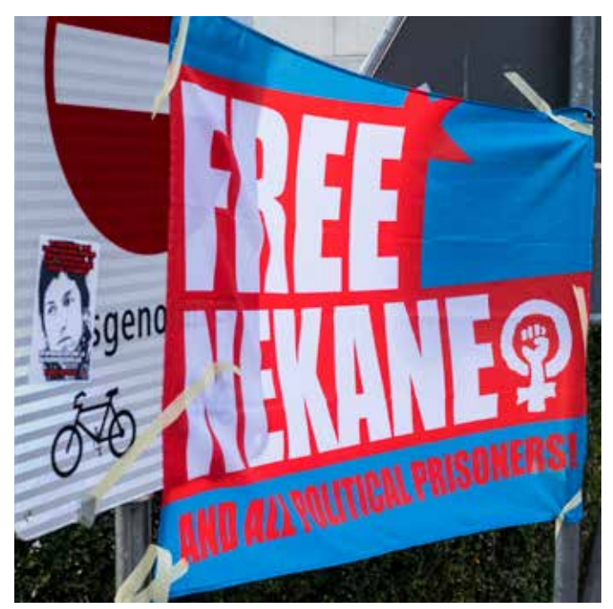
Spain accused of torture.

One case which attracted public attention during the year under review owing to its human rights dimension – the alleged violation of human rights – concerns a Spanish request for the extradition of an individual on the grounds of participation in a criminal organisation (the Basque separatist group ETA). Following an extensive analysis, the DILA approved the extradition, its decision being upheld by the Federal Criminal Court. The Federal Supreme Court was ultimately not required to rule on the case, because Spain subsequently withdrew its extradition request on the grounds that the sentence that had been passed had become statute-barred.