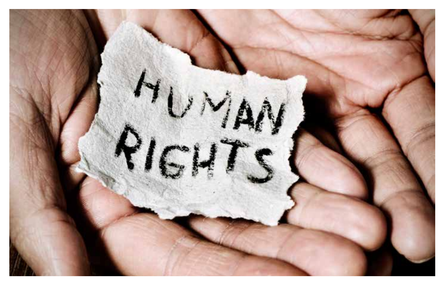
It is imperative that human rights are respected.

Examining the issue of whether or not basic rights are likely to be infringed in a given case falls within the remit of all authorities tasked with providing mutual legal assistance. Extradition procedures are certainly worthy of particular mention in this respect, because their purpose is to hand over an individual sought abroad to the requesting state so that they can be prosecuted or