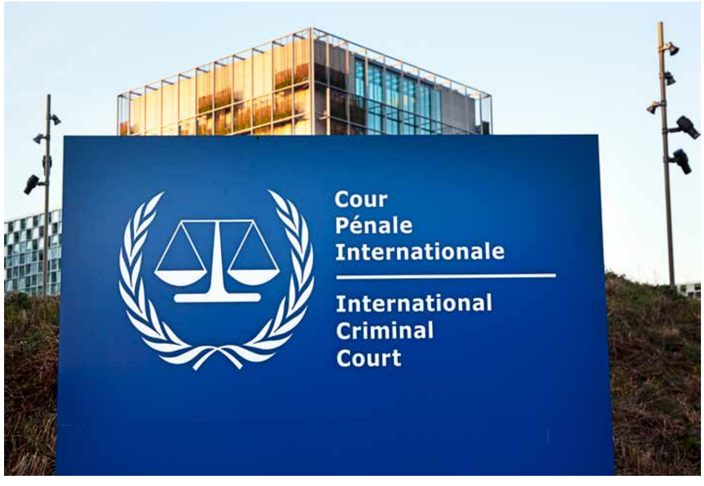
The International Criminal Court in The Hague, Netherlands.